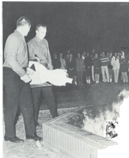
Arkansas Hog goes into the Homecoming 1945 bonfire.