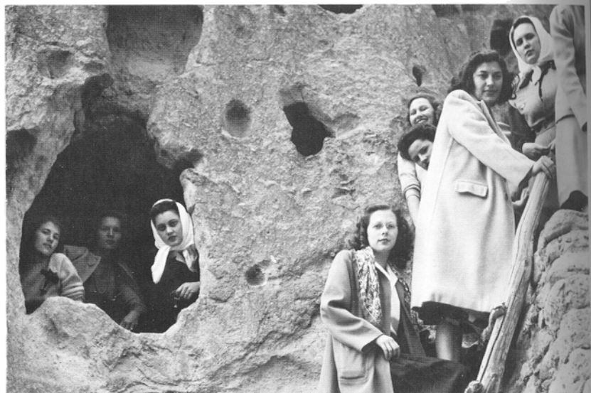
Ko Sharis climb into ancient caves in Frijoles Canyon on an exploration.