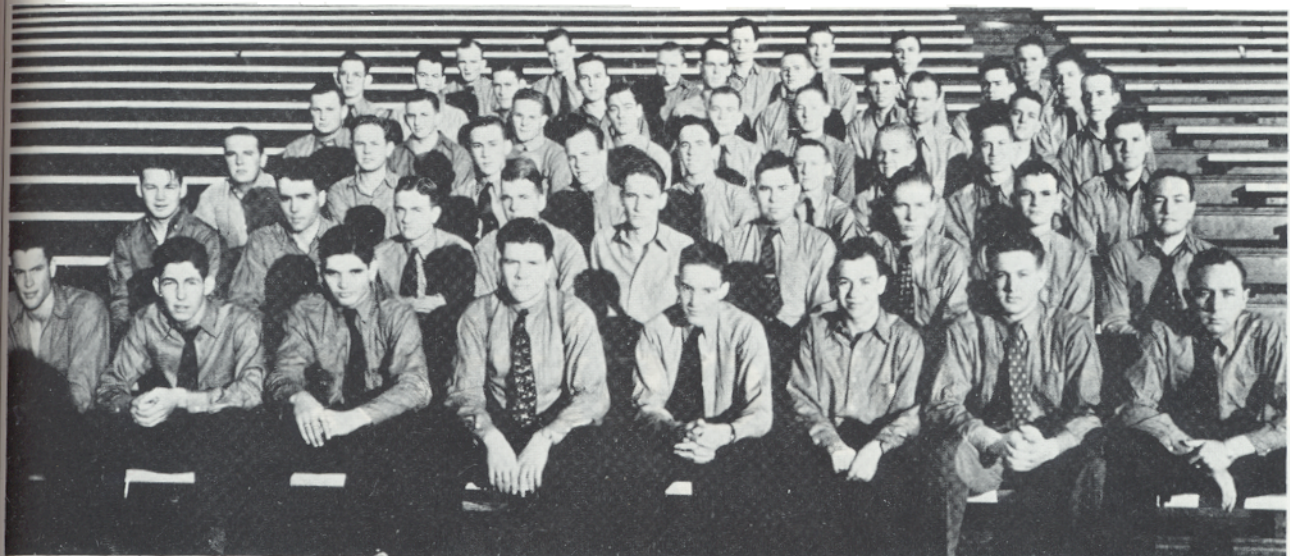
The Saddle Tramps as they appeared in the 1937 La Ventana.

So if you want to know whose names are on the Administration Building or why there is a blarney stone in front of the Engineering Building, ask a Saddle Tramp.