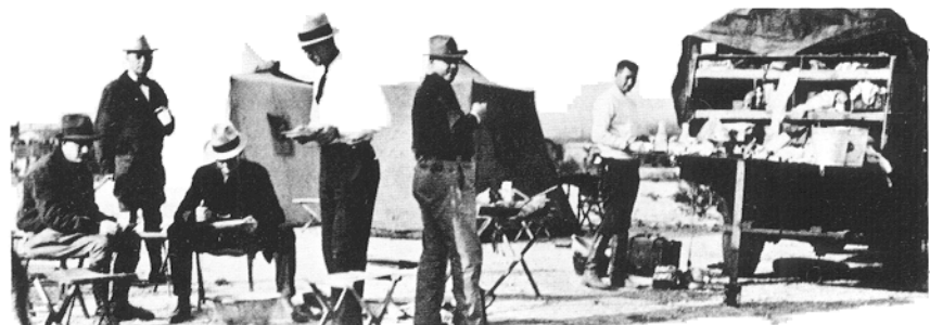
The expedition camped and did their own cooking.