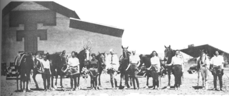
Tech women riders in front of the gymnasium.

Indeed, Tech's first women athletes displayed tremendous optimism and enthusiasm. As one Tech hiker commented after a 50-mile hike from Lubbock to Plainview, which left her sunburned and with blistered feet, "would we do it again . . . we would!"