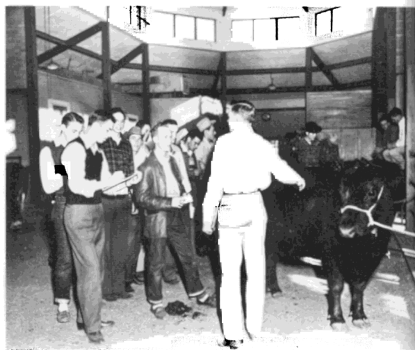
An early ag class uses the Pavilion.

The Pavilion hosted its first of many judging contests for area high school students in 1926 when seven teams participated; in 1928, 28 teams judged here, and through the