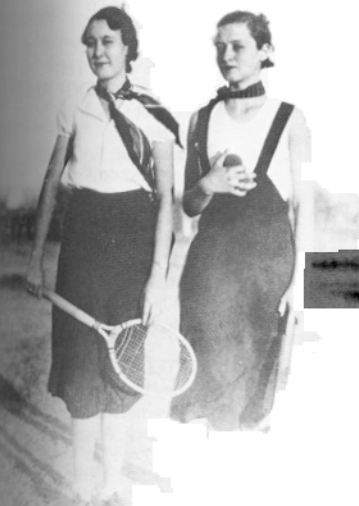
These beauties were two of Tech's first women tennis players.