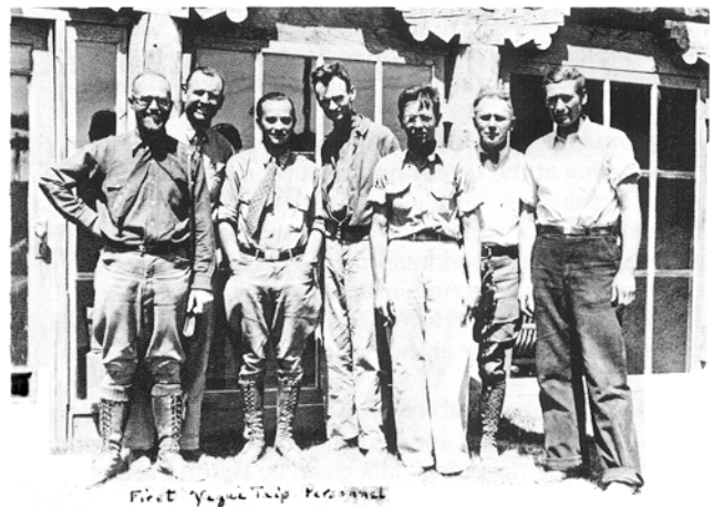
The Yaqui Expedition members . . . before and after.

Fifty years ago, a party of Texas Tech University professors, Lubbock community professionals and a Harvard professor made one of the earliest scientific expeditions among the Yaqui Indians of Sonora, Mexico