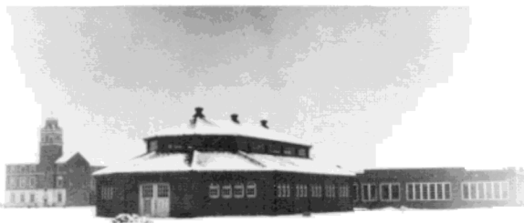
The Pavilion, built in 1925, was an original Tech structure.

Tech's watchword became, "Do the best you can with what you have." In that light, this little building well served its purpose, and coincidentally, I'm proud to say, so has Texas Tech.