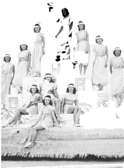
Prize-winning Ko Shari float decorated in turquoise and silver, 1949.