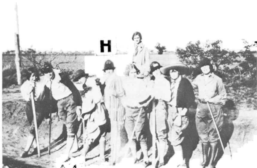
Women's hiking group one mile south of Hale Center on the second day of the 50-mile Lubbock to Plainview hike.