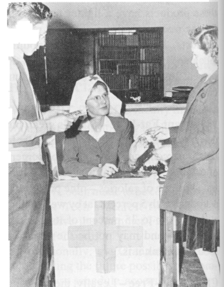
Students make contributions for the Red Cross war relief drive, 1942-43.