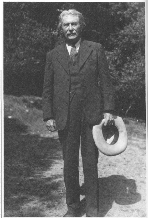
Earnest Thompson Seton, 1938.