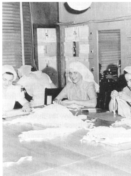
Tech students make surgical masks for the Red Cross, 1942-43.

Today, 50 years after the publication of this yearbook, La Ventana still depicts daily life at Tech, but none is as dramatic as the 1942-43 issue which shows a country and campus coming to grips with a world war. All La Ventanas, from 1926 to date, are available for use at the Southwest Collection. F