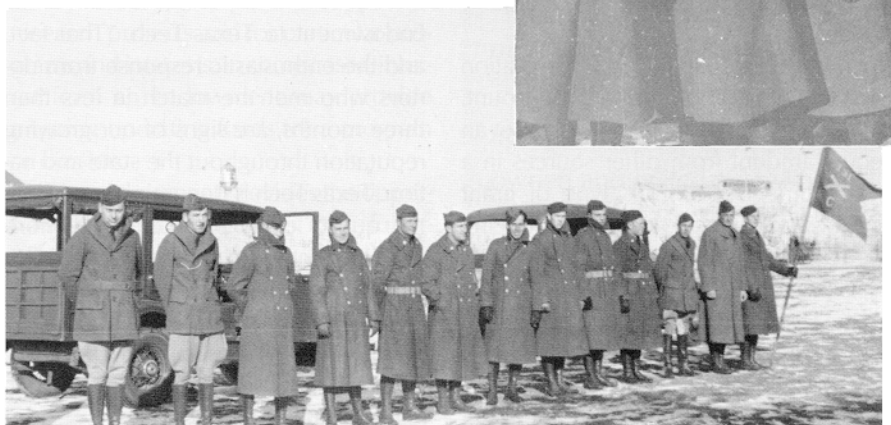
Officers of the 131st Field Artillery at Texas Tech Bivouac, November 1940.

division made its September 1943, Salerno landing that made it the first American division to invade Europe. Fighting in some of the fiercest battles, divisional units suffered through "Lost Battalion" incidents in both the Pacific and European theaters, and the division, as a