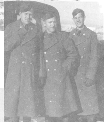
Three members of the 131st Field Artillery in Lubbock.