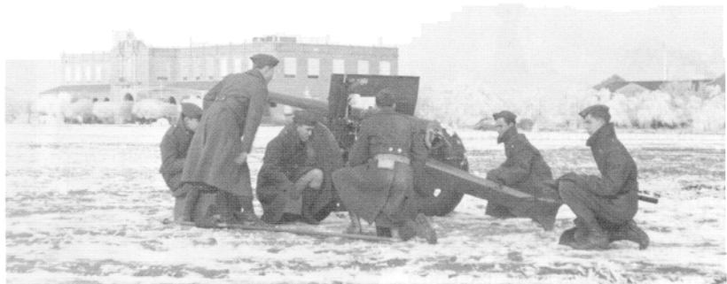
Troops take part in field maneuvers during an ice storm that settled in over the Tech campus in November 1940.

By November 1940, the 36th Division mobilized, and a year later a detachment found itself troop-ship bound for the Western Pacific. Later, the rest of the