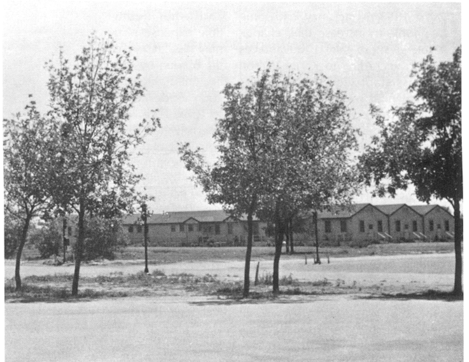
Original Student Union Building, circa 1949.

The Southwest Collection recently received a collection of correspon-