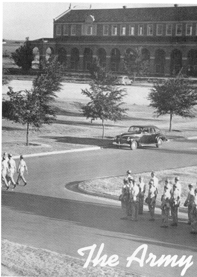
1944, Lo Ventano

In January 1943 the commanding officer of Lubbock Army Air Field inspected the campus to determine its ability to support an aircrew-training program. He reported that the attitude of students and faculty as well as its facilities and proximity to civilian flying fields made the campus a highly suitable location for such a program which could handle 1250 trainees. On Feb. 19, 1943 the