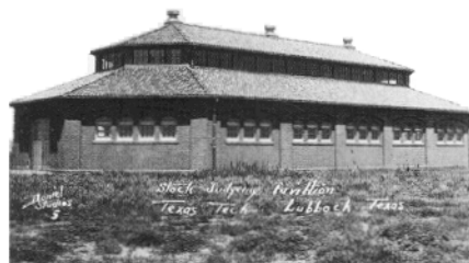
The centrally located Livestock Judging Pavilion remains one of the most distinctive buildings on the Texas Tech University campus.

One of the original structures, the Livestock Judging Pavilion was once