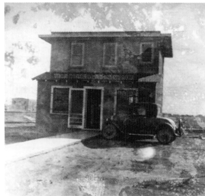
Early bookstore facilities on the Texas Tech campus served as meeting places for students until the University Center was built.

used by the animal science department, as well as for a theatre production and basketball games. Now commonly referred to as the "Ag Pavilion" by most, this gem has undergone several restorations and upgrades to extend its lifespan. Livestock no longer parade through the building. Instead, students of landscape architecture enjoy their drafting classes here, in what is probably one of the most scenic of all Texas Tech facilities.