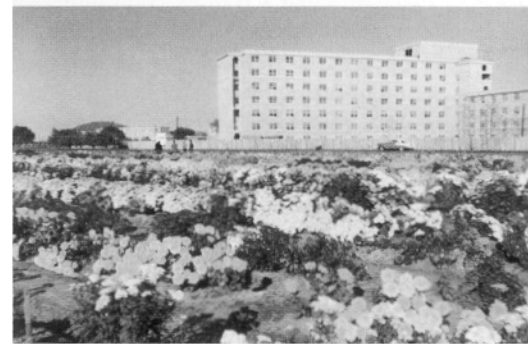
Although not grown in abundance on campus as they once were, chrysanthemums continue to bloom every fall in several locations.

Lubbock was once touted as the "Chrysanthemum Capital of the World," and evidence of this fact proudly covered the Texas Tech campus. A red-gold variety of the flower was even named after Texas Tech administrator Marshall Pennington in 1966. Thousands of bright chrysanthemums were planted until around the 1970s when problems with the saline content in groundwater made it difficult to grow them. Smaller plots of the flowers were planted later. Further landscaping has resulted through the efforts of the Campus Caregivers, which revived the Arbor Day planting activities that had been founded by President Bradford Knapp back in 1938.